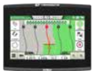
G7 Plus Farmnavigator