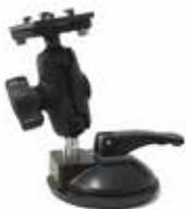
Heavy Duty suction cup holder