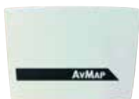
Dust Protective cover